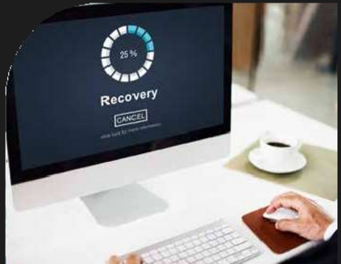
FOCUS ON BUSINESS STRENGTH