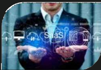
SLA Management System