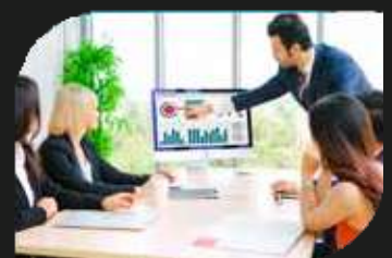
Lead Management System