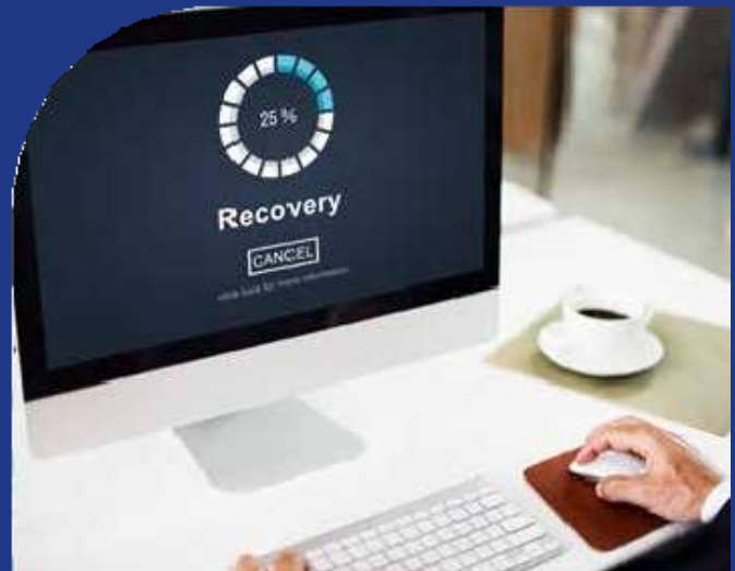
DISASTER RECOVERY SITE IMPLEMENTATION

At our IT solution firm, we offer a wide range of data center services to ensure the reliable and efficient operation of your IT systems such as LAN Infrastructure, Power Backup Solutions (DC rectifiers, Industrial grade UPS, AVR, Solar PV solutions, PDU, ATS) ISP Data Links (Dark Core, MPLS Over GSM), Virtualization/HCI Solutions, Cybersecurity Solutions, VOIP Solutions and much more. Our state-of-the-art data centers are equipped with advanced security and monitoring systems to ensure the safety and integrity of your data. With our expert team of engineers and technicians, you can trust that your data center operations are in capable hands.