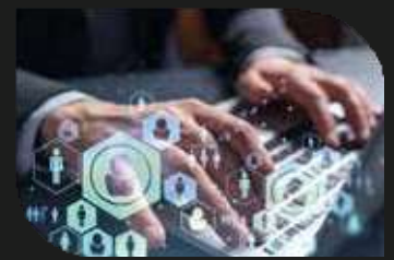
Human Resource Management System