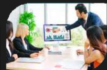
Lead Management System