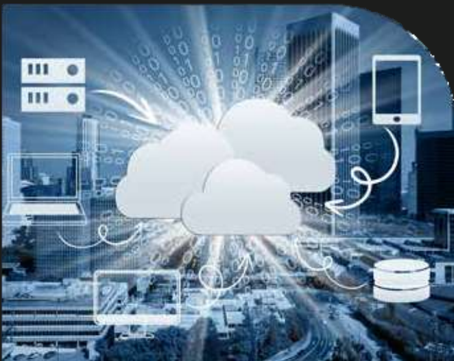
EXPAND SALES NETWORK