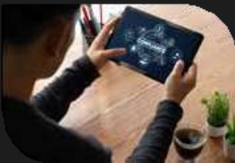
Restaurant Management System