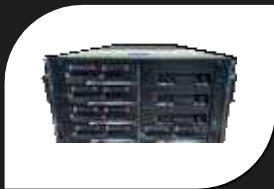
Blade Server/ Chassis