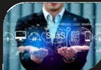
SLA Management System