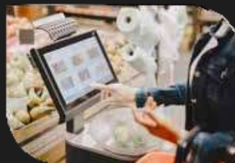
Retail Management System