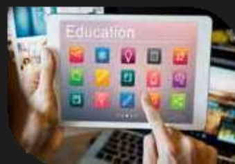
School/Course Management System