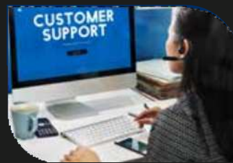
Helpdesk Management System