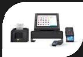
Complete POS System