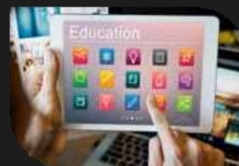
School/Course Management System