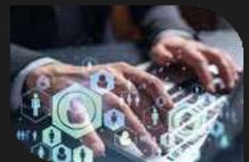
Human Resource Management System