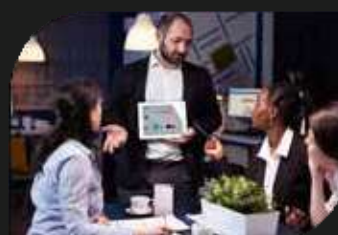
Project Management System