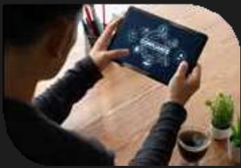
Restaurant Management System