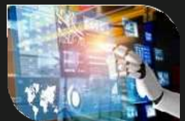
Goods Transport Management System