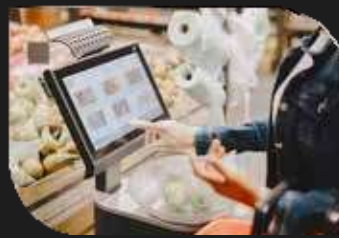
Retail Management System