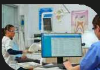
Hospital Management System