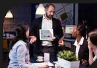
Project Management System