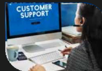
Helpdesk Management System