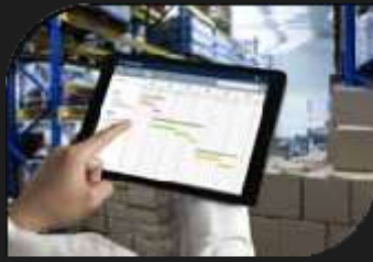
Inventory Management System